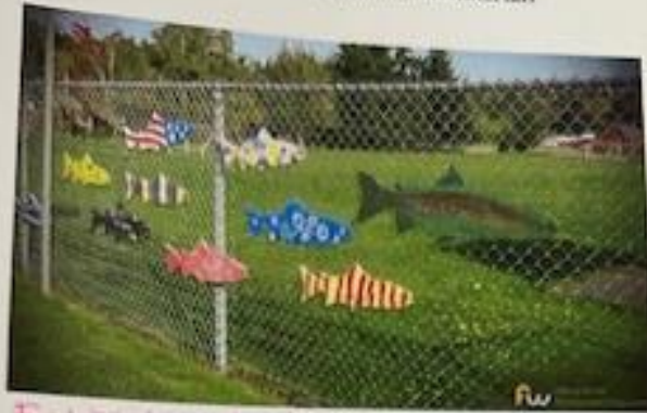
Fig.1 explain what this picture is